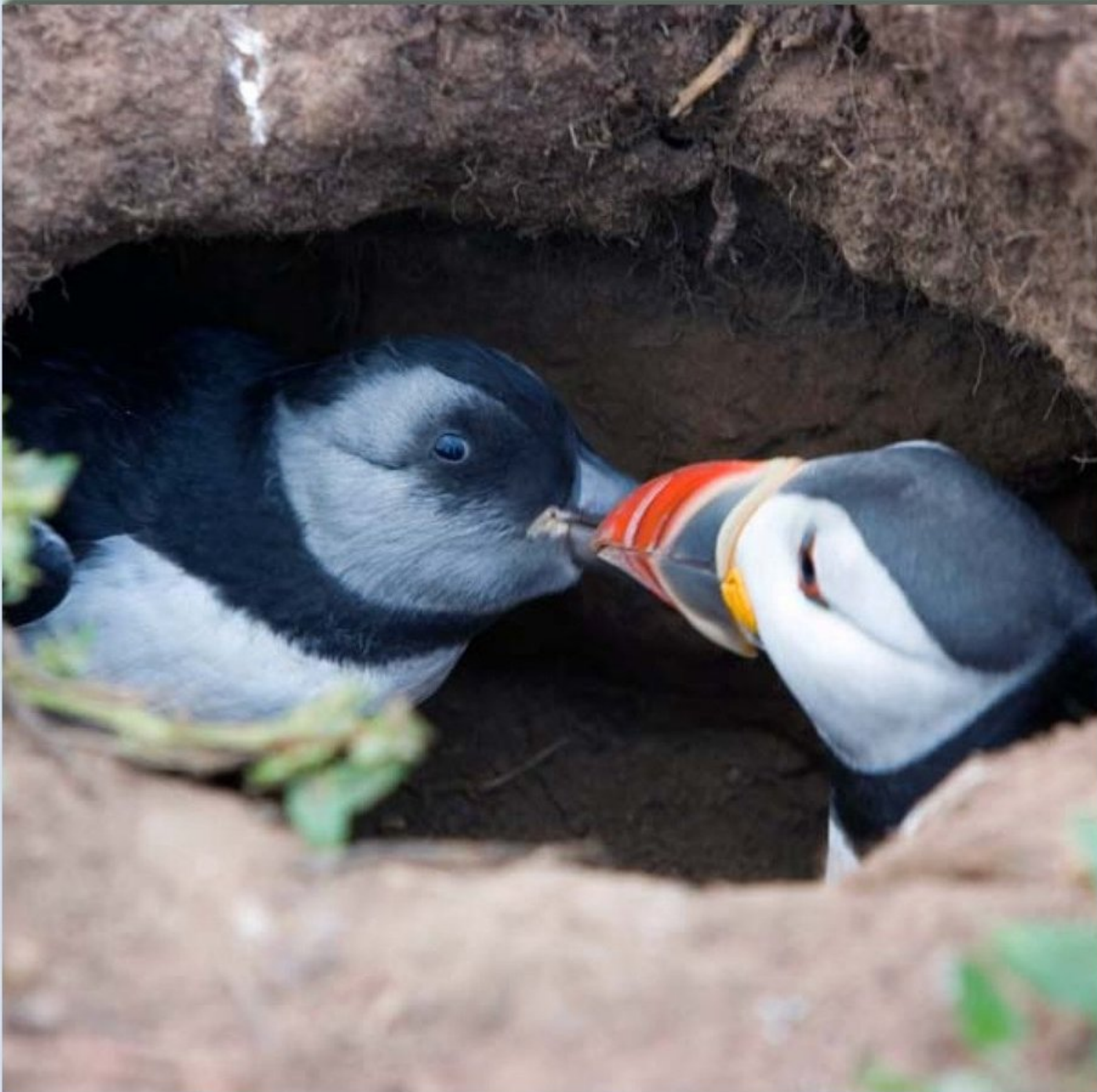
A puffin feeds its chick.