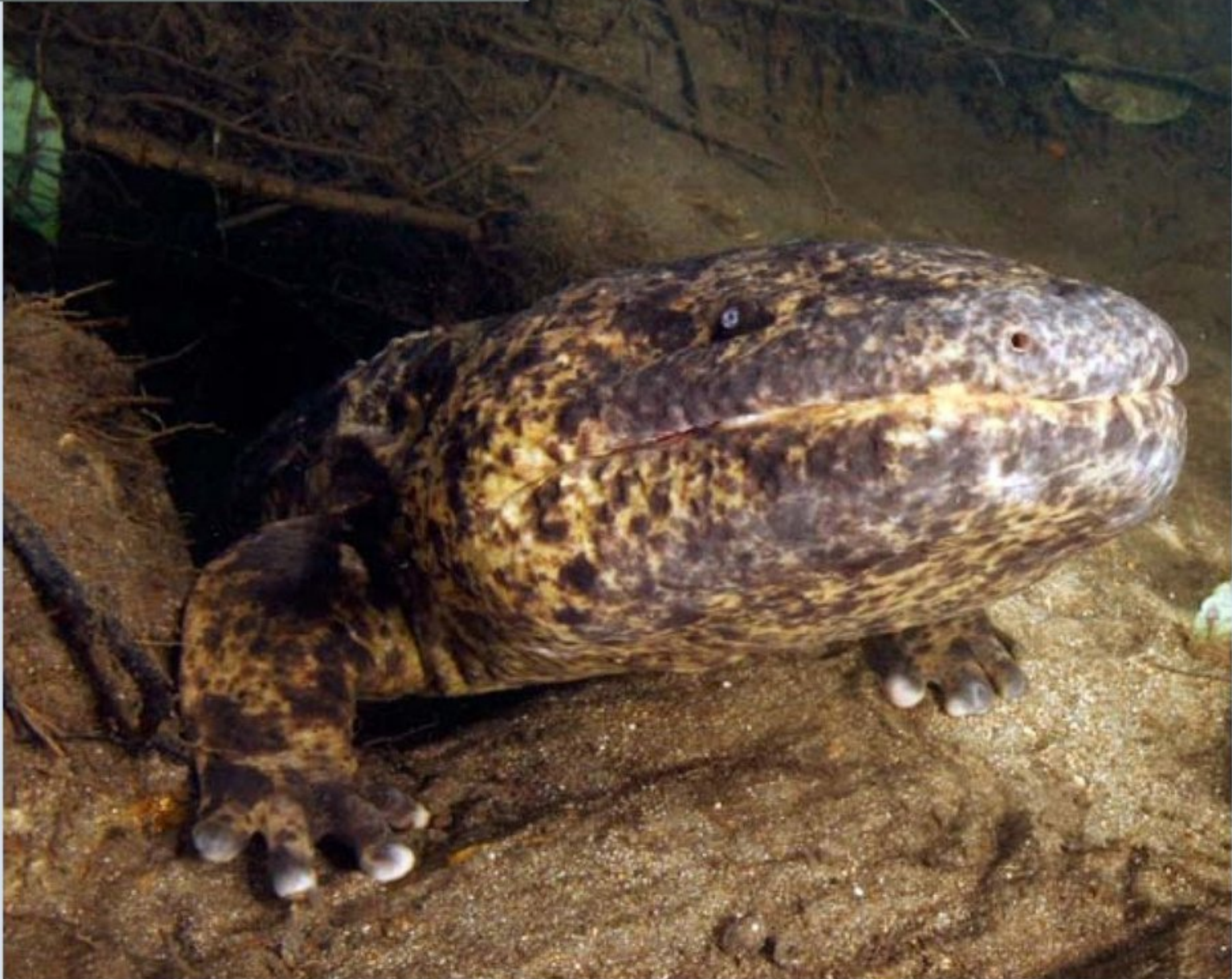
A Japanese giant salamander comes out of its burrow.