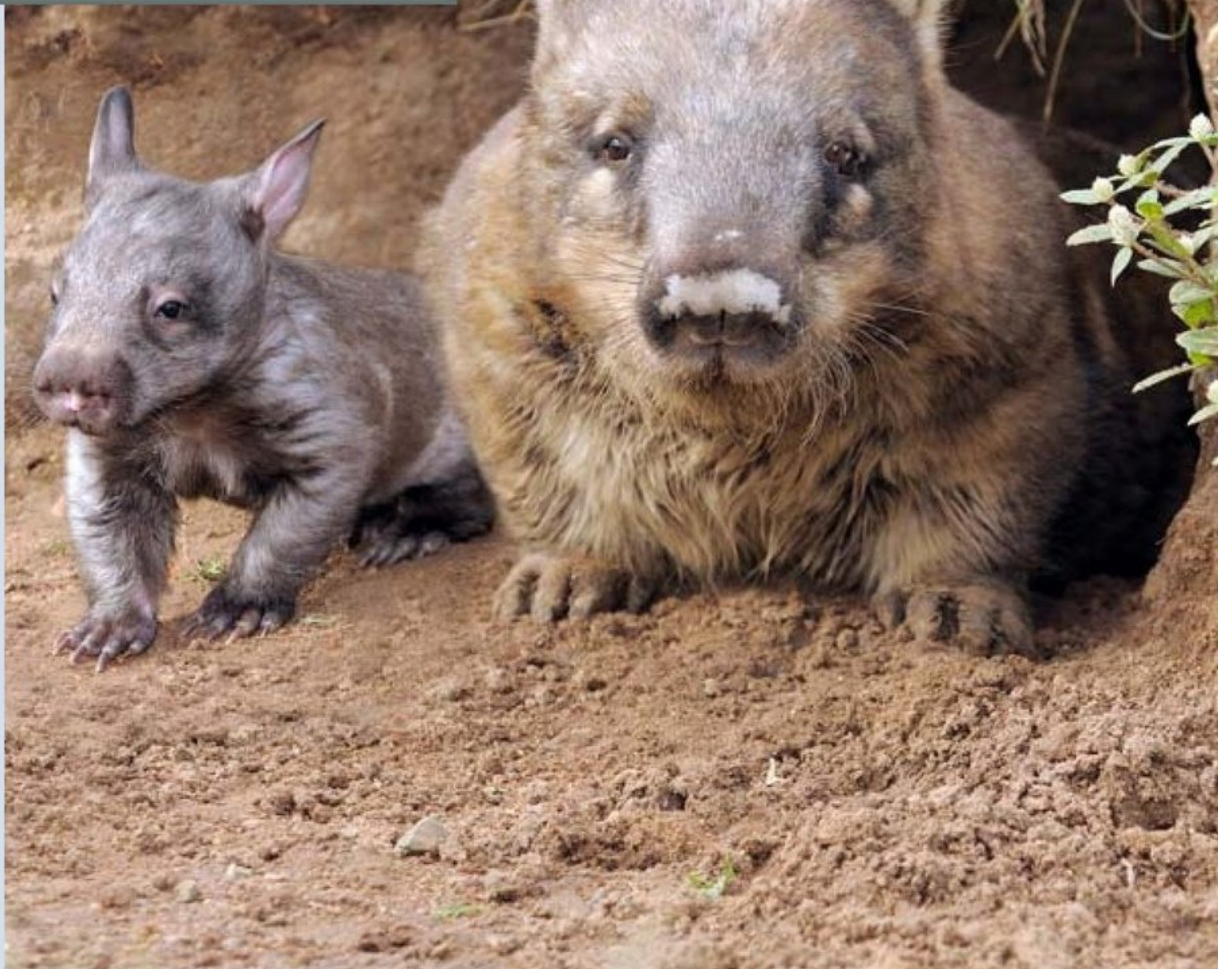
A mother and baby wombat look out of their burrow.

A wombat's burrow may be as long as three school buses!