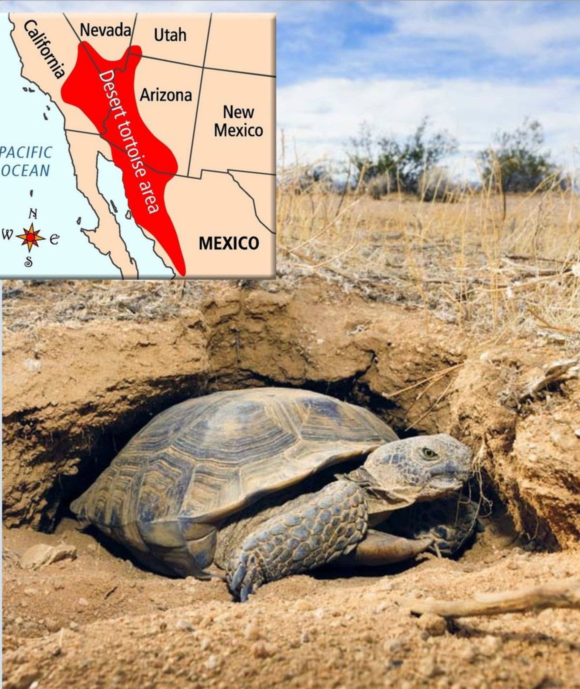
A desert tortoise hangs out in a burrow.