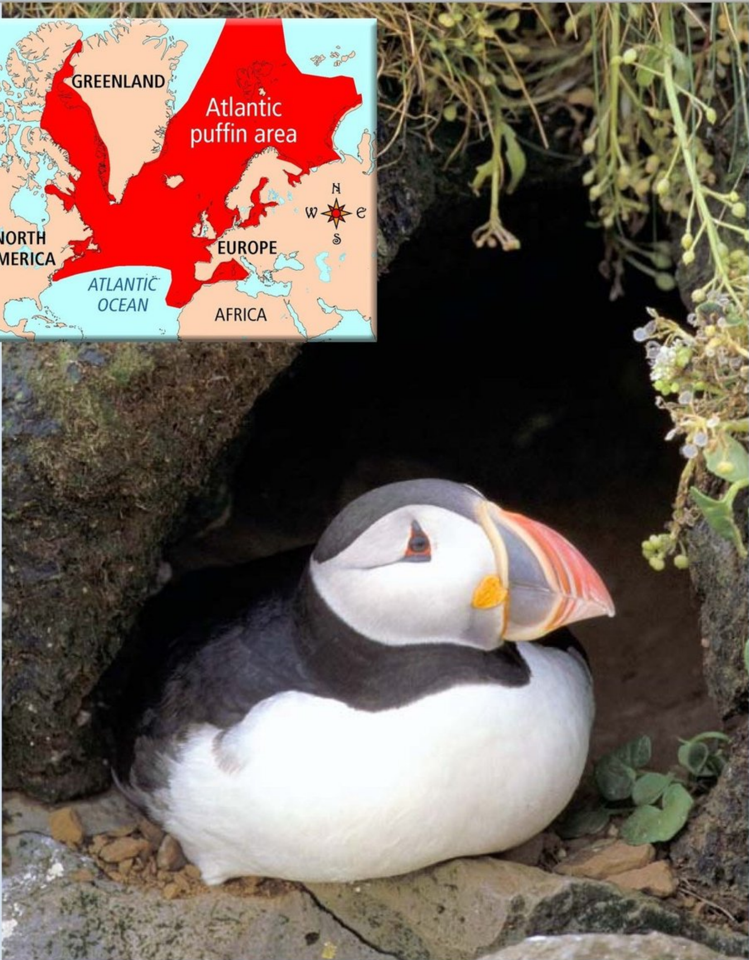
An Atlantic puffin sits in its burrow.