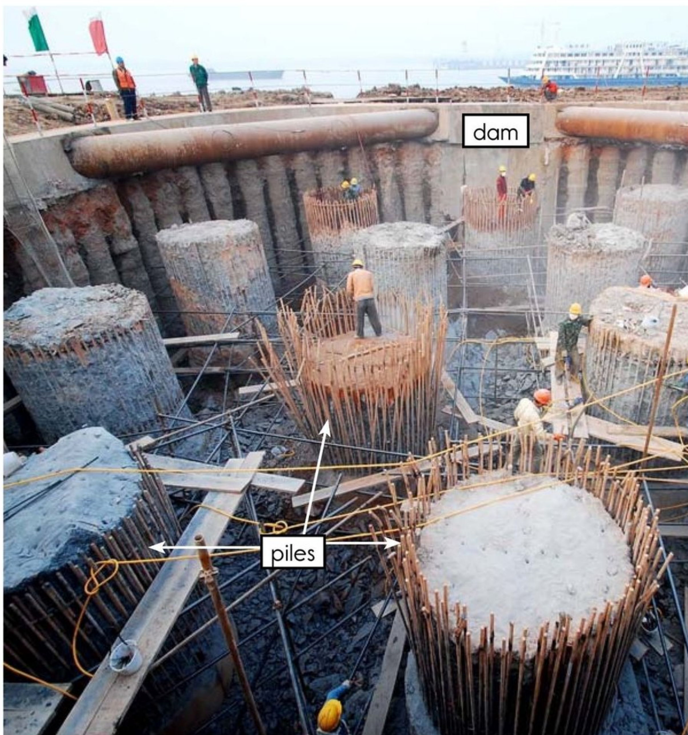
Inside a dam