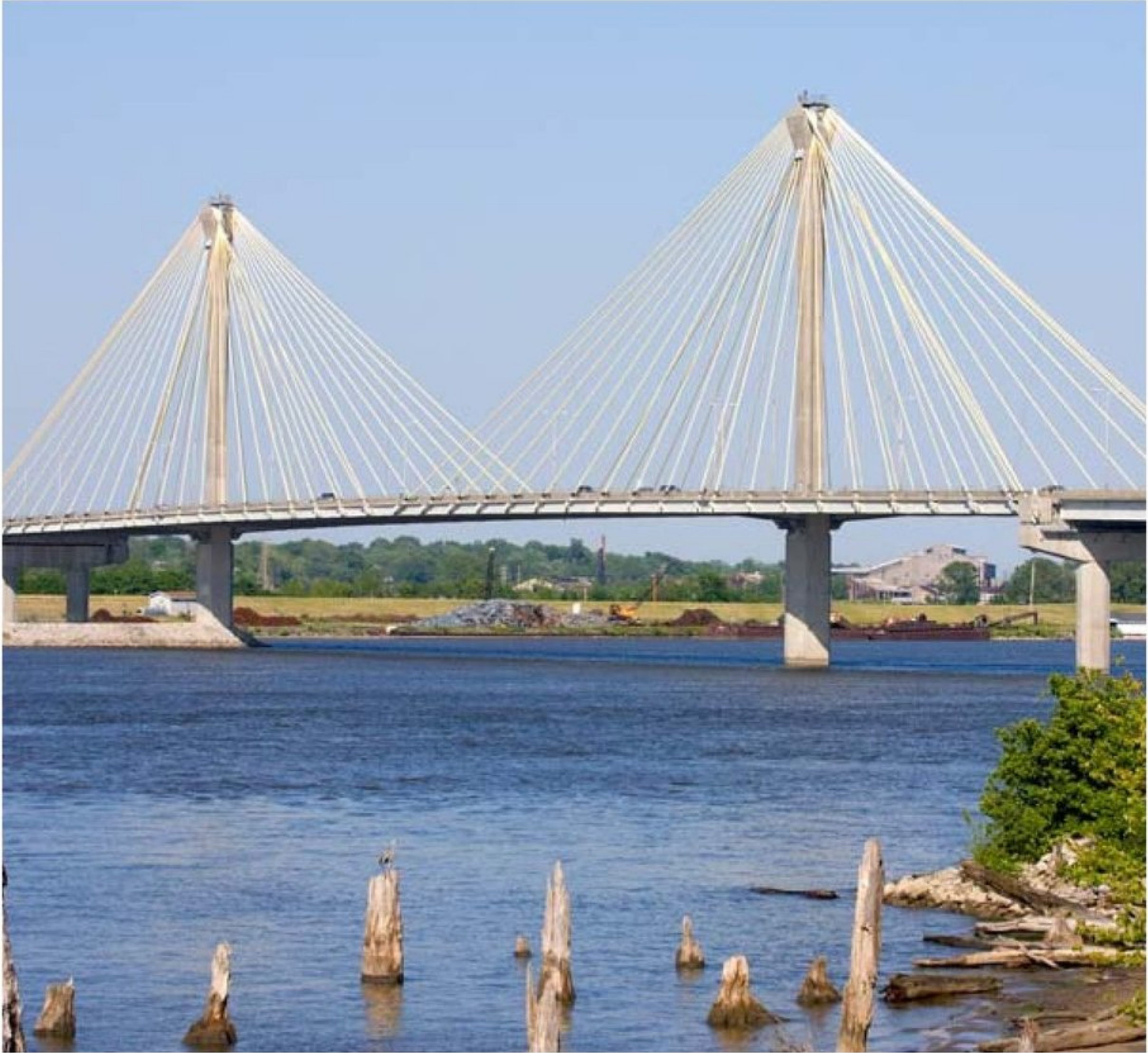
The Clark Bridge over the Mississippi River at Alton, Illinois.