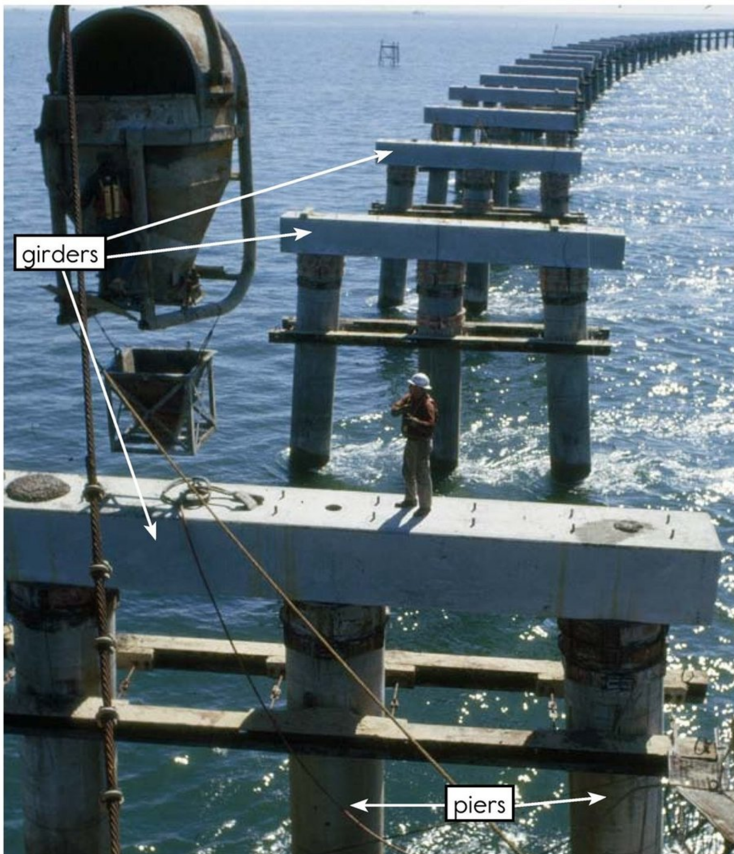
Cap being put into place