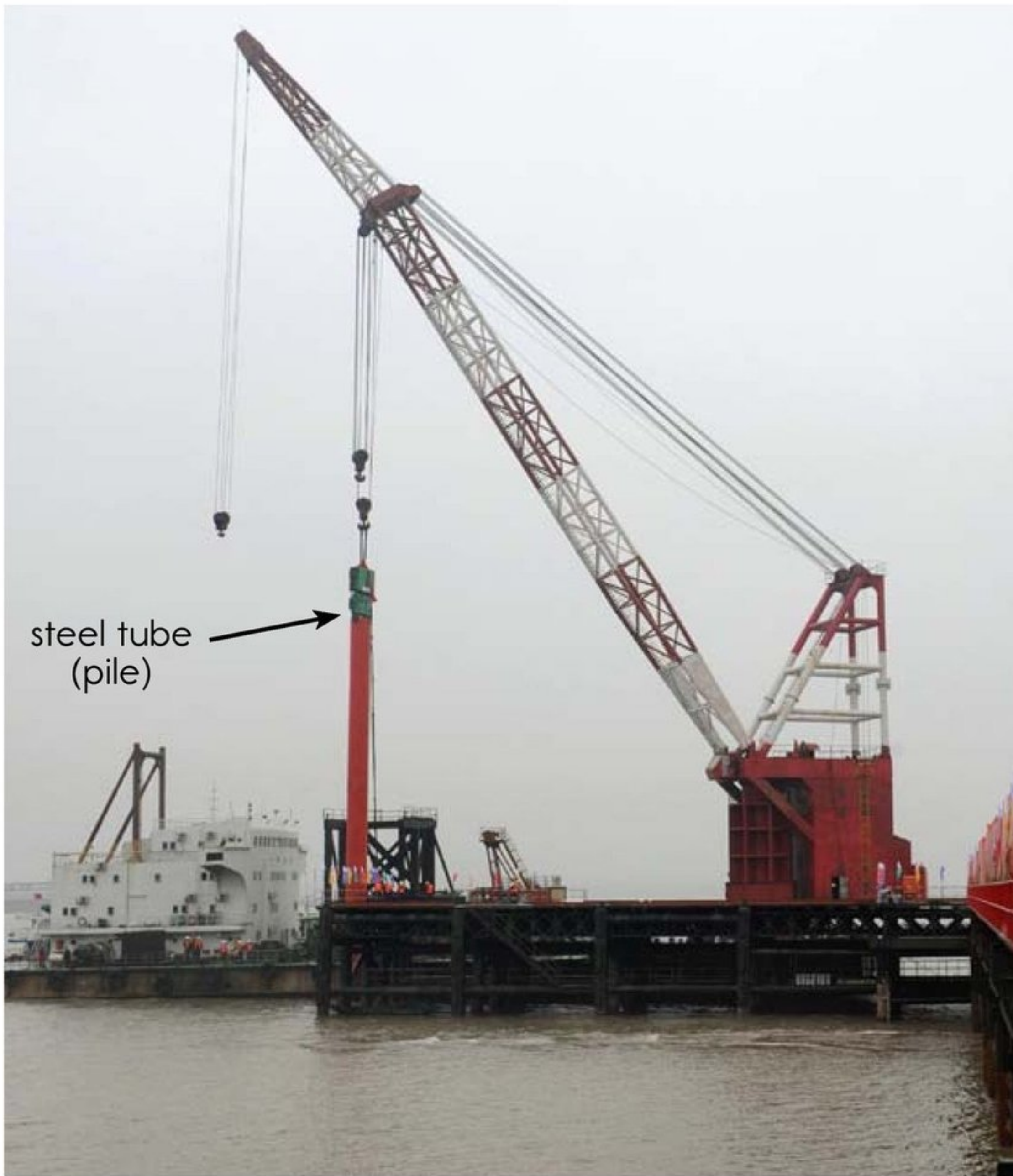
Steel tubes being hammered into the river bottom