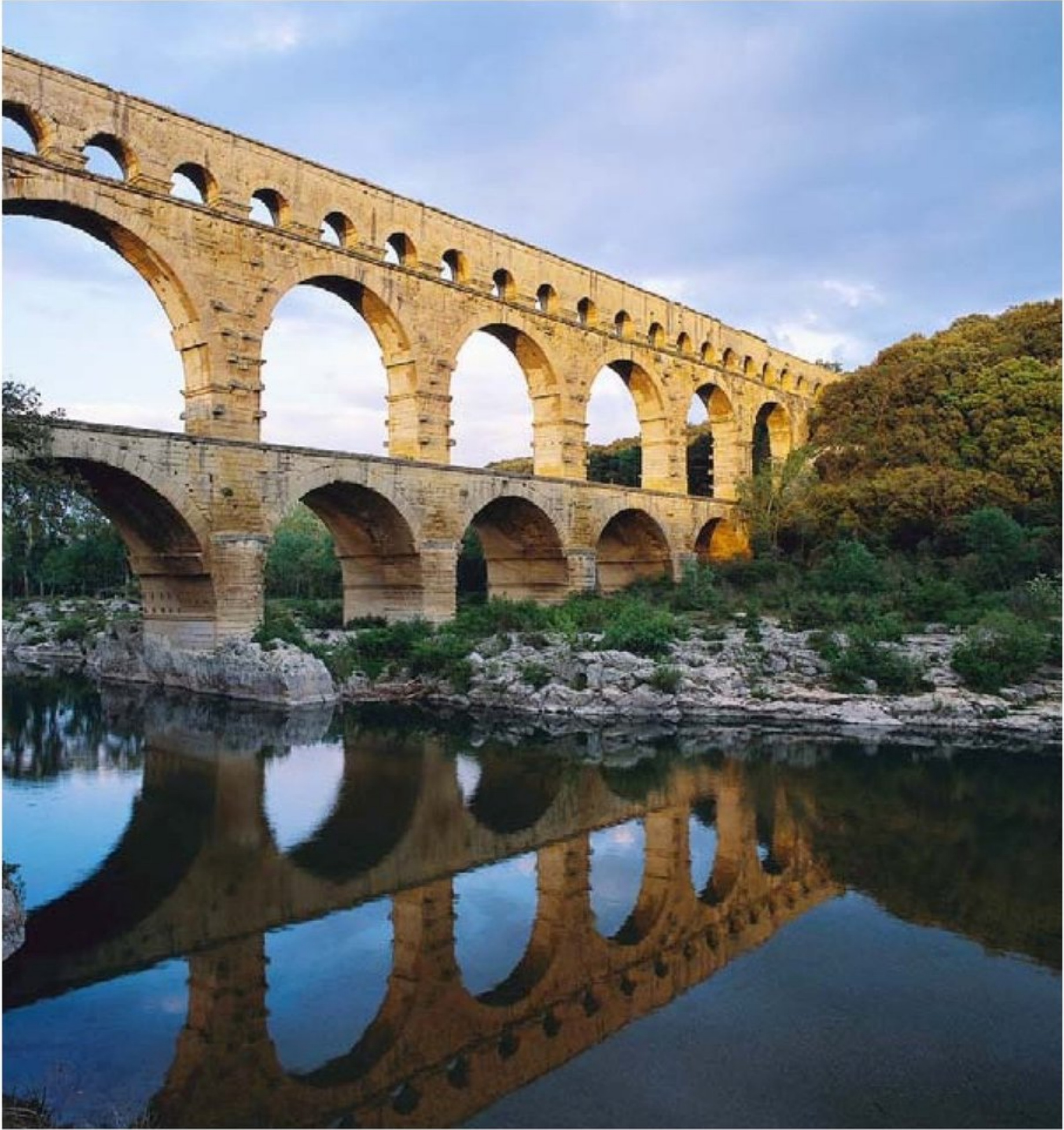
Pont du Gard Aqueduct near Nîmes, France