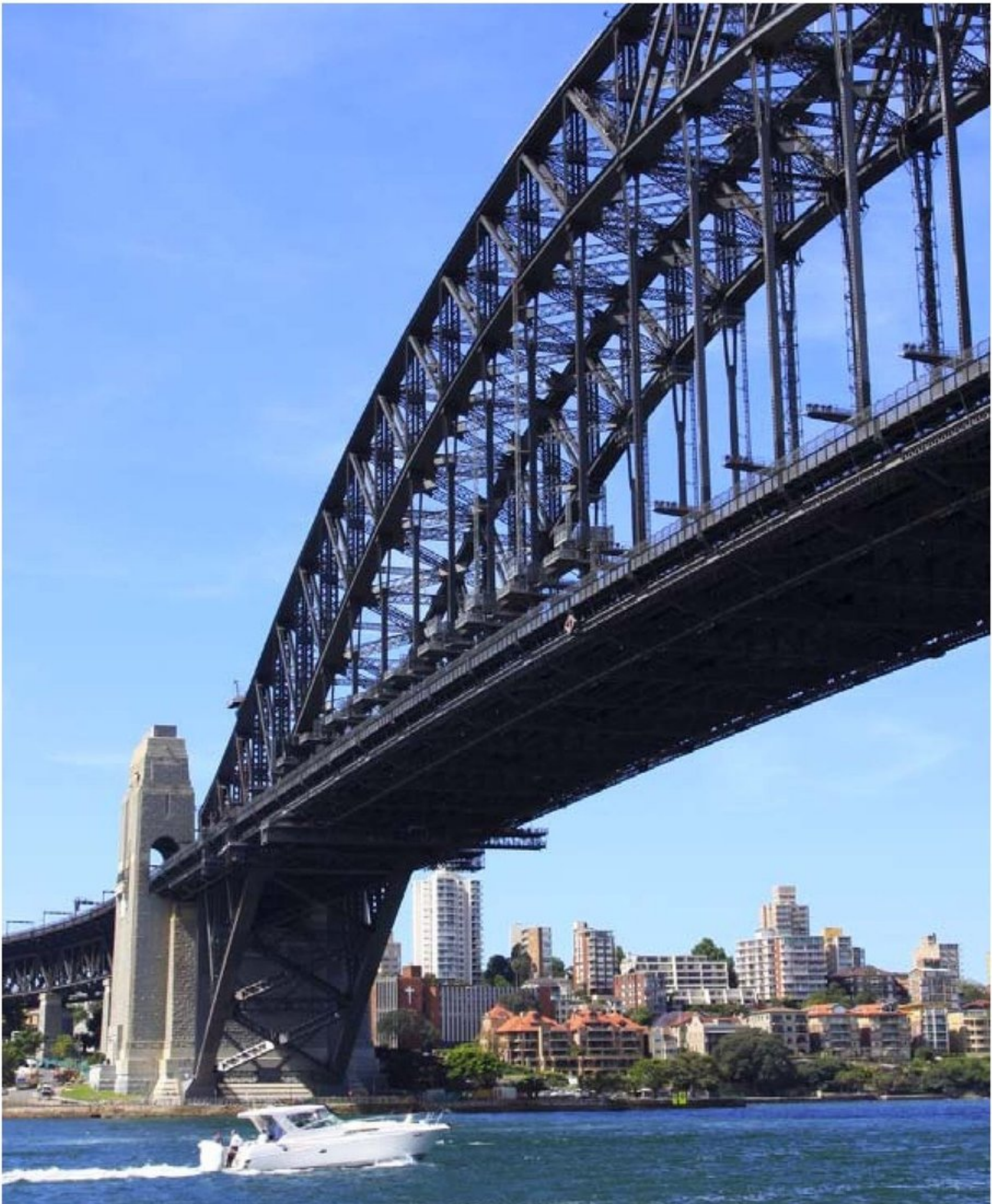
Sydney Harbor Bridge, Sydney, Australia