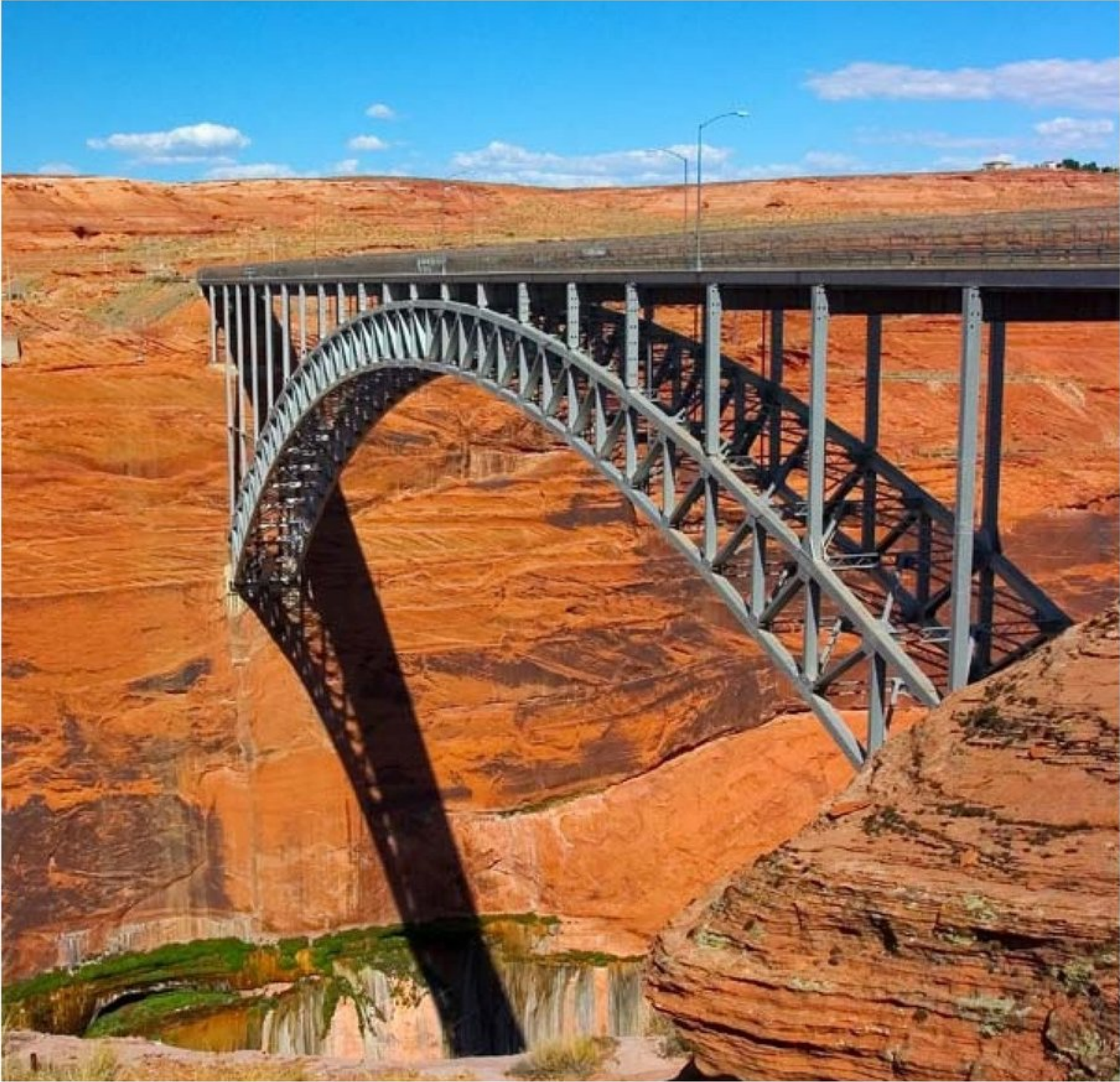
Glen Canyon Dam Bridge, Arizona