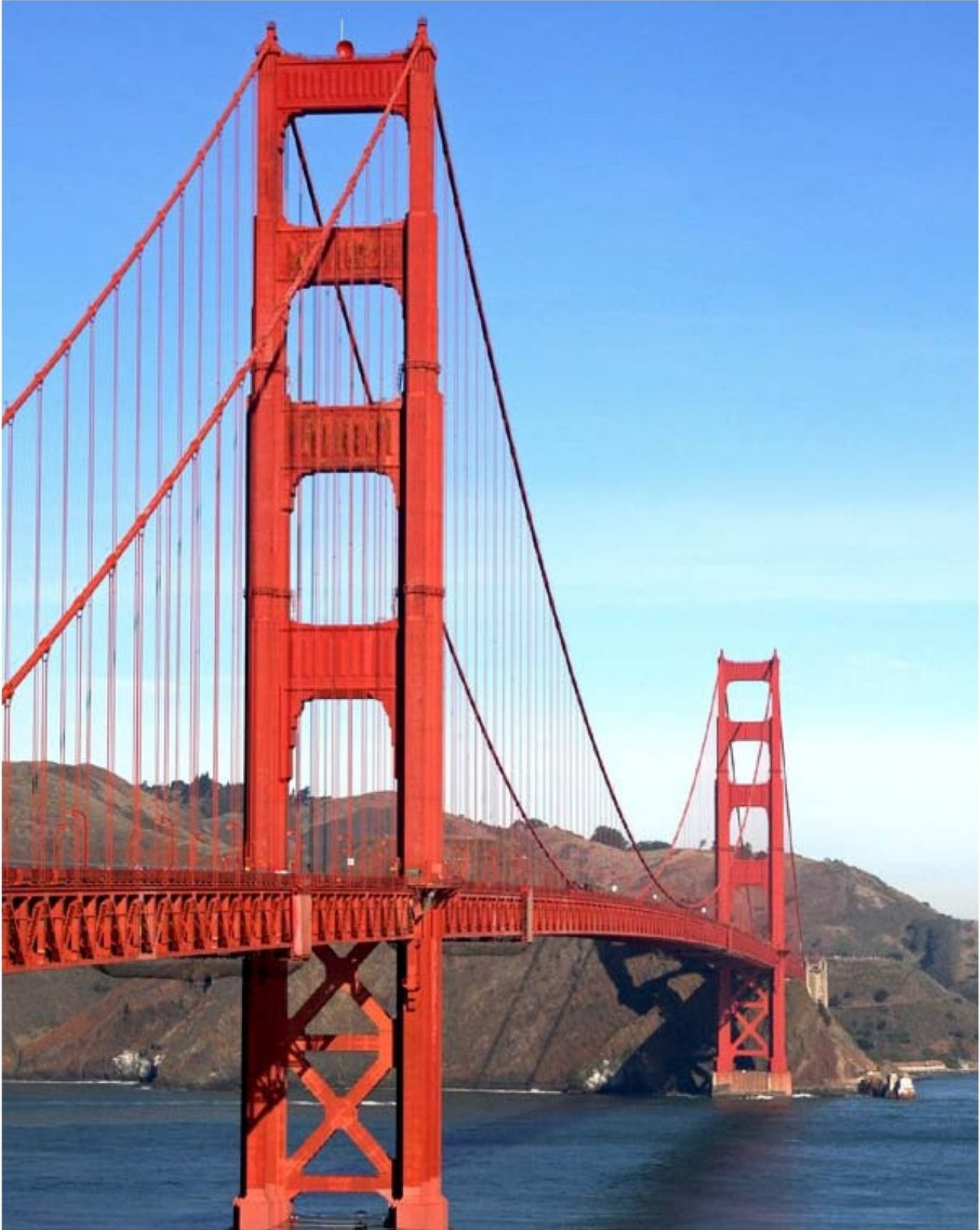
Golden Gate Bridge, San Francisco, California