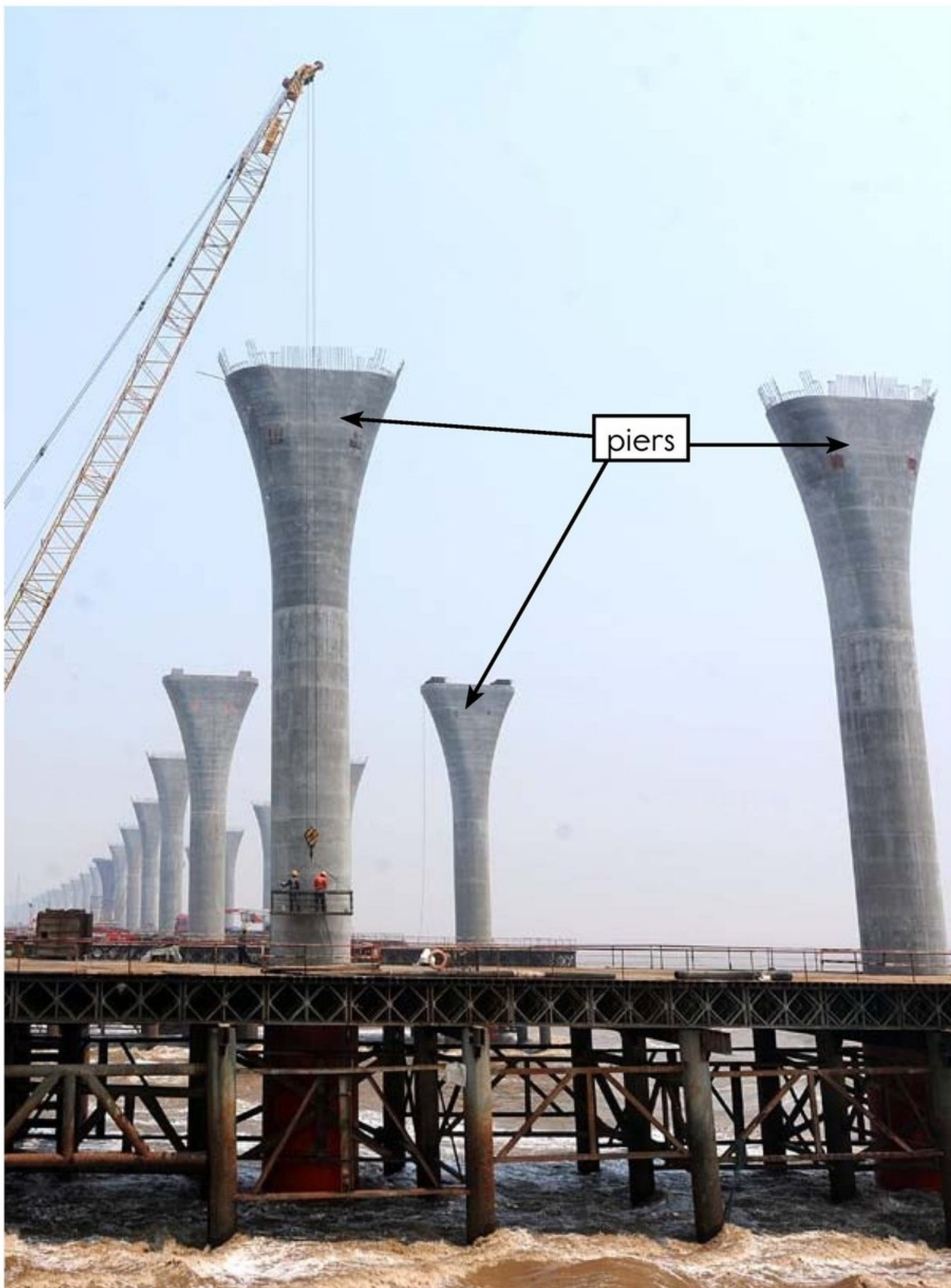
Installing bridge piers