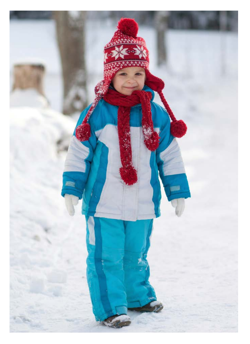
This winter hat has fuzzy puffs.