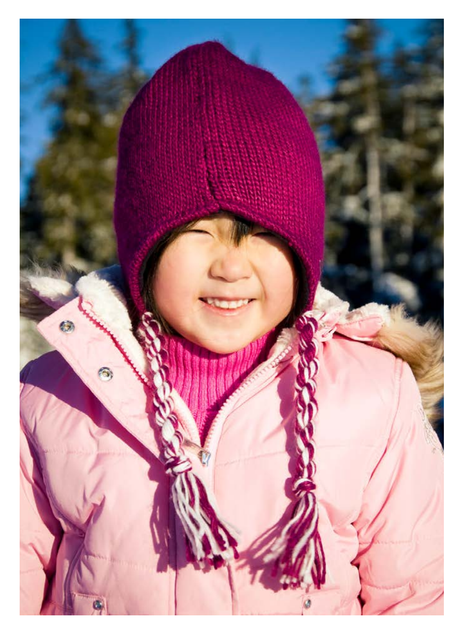
This winter hat has long strings.

Winter is here! It's time to wear a winter hat.